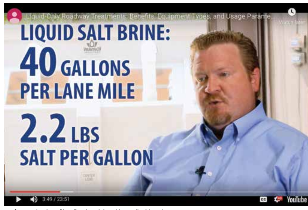
Screen shot from Clear Roads training video on liquid roadway treatments

Clear Roads created two training videos to help agencies expand their use of liquids: