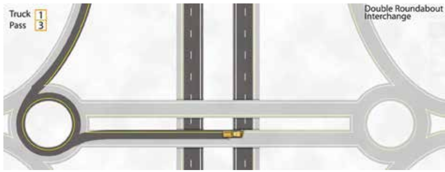
Image from Clear Roads training on Plowing Intersections and Interchanges (from Practice Manual)

Of course, there's no one right way to clear an intersection. For each layout, the project committee and researchers evaluated multiple approaches and agreed on one to highlight as a best practice. "By showcasing one approach to clearing an intersection, it may