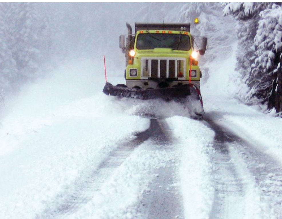
The winter-severity index developed by Clear Roads includes obvious factors, such as snowfall amount, but also indicators more difficult to quantify, such as the occurrence of blowing and drifting snow, which can dramatically increase the difficulty of snow removal.

This model data was then loosely fitted to aggregate observations from weather stations in order to ensure the weather data underlying the project was grounded in reality. The researchers used a suite of algorithms to derive hour-by-hour estimates of historical snowfall rates and the occurrence of blowing and