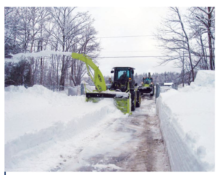
Standardizing data collection across agencies and accounting for level of service will further enhance agencies' ability to compare winter-maintenance costs with states that have similar climates and roadways, allowing them to consider new budget scenarios.

By facilitating comparisons across storms, the maps will ultimately allow agencies to improve the efficiency of their winter-maintenance operations by helping them better estimate the costs of snow and ice removal and compare the relative costs of in-house crews and contractors, according to Paul Brown,