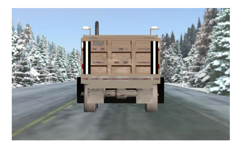
Figure 2.4 Snowplow Lighting Recommended by University of Minnesota Researchers

Figure 4.1 on page 28 of the report (page 37 of the PDF), reproduced in Figure 2.4 below, shows the rear-end lighting recommended by researchers. The lighting application includes vertical bar lights that "are steady burning light arrays flanked by dense black bars to enhance and maximize contrast."