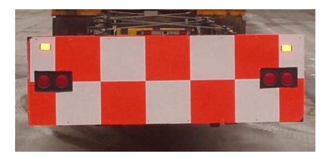
Figure 2.8 Recommended Checkerboard Marking Pattern (Mid-America Transportation Center)

Study results led researchers to recommend the use of a red and white checkerboard marking (see Figure 2.8).