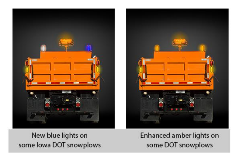
Figure 2.5 New Rear Lighting on Some Iowa DOT Snowplows

Figure 2.5 shows placement of new blue lights and enhanced amber lights on some Iowa DOT snowplows.