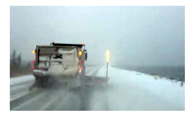
Figure 2.6 Michigan DOT's "Superior Stick"

Figure 2.6 shows the Superior Stick installed on a wing plow used to clear active lanes of traffic and shoulders.