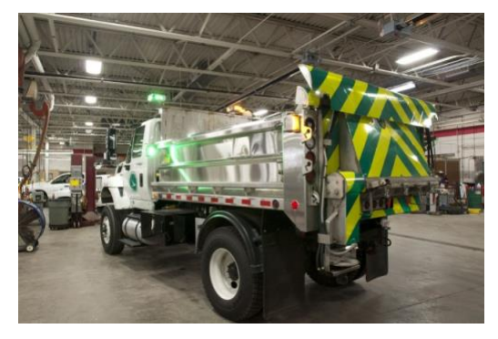
Figure 2.7 Ohio DOT's Combination of Colored Lights for Snowplows