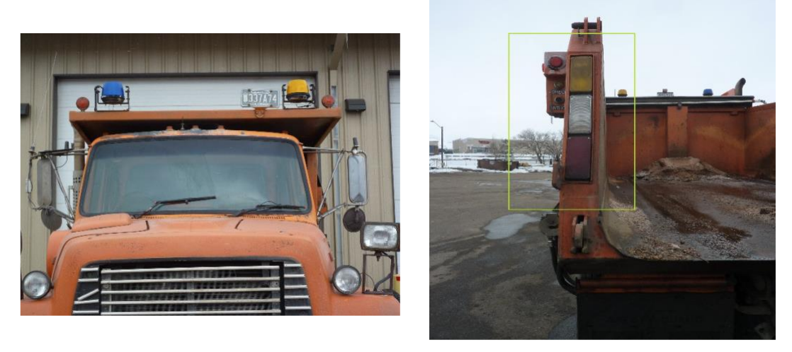
Figure 2.3 Examples of Forward and Rear Snowplow Warning Lights

Snow Rendering for Interactive Snowplow Simulation—Supporting Safety in Snowplow Design, Peter Willemsen, Intelligent Transportation Systems Institute, Center for Transportation Studies, University of Minnesota, January 2013.