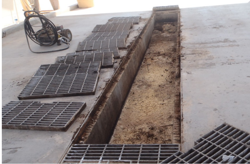
Photo 2: Clean trench as needed to keep sediment out of the trench drain