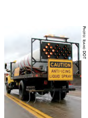
The environmental effects of anti-icing and deicing practices are a major concern for state DOTs.