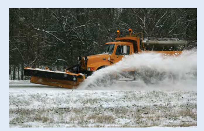
Snowplow operators often must work long shifts, and fatigue is a safety concern for transportation agencies. A Clear Roads research project is under way.