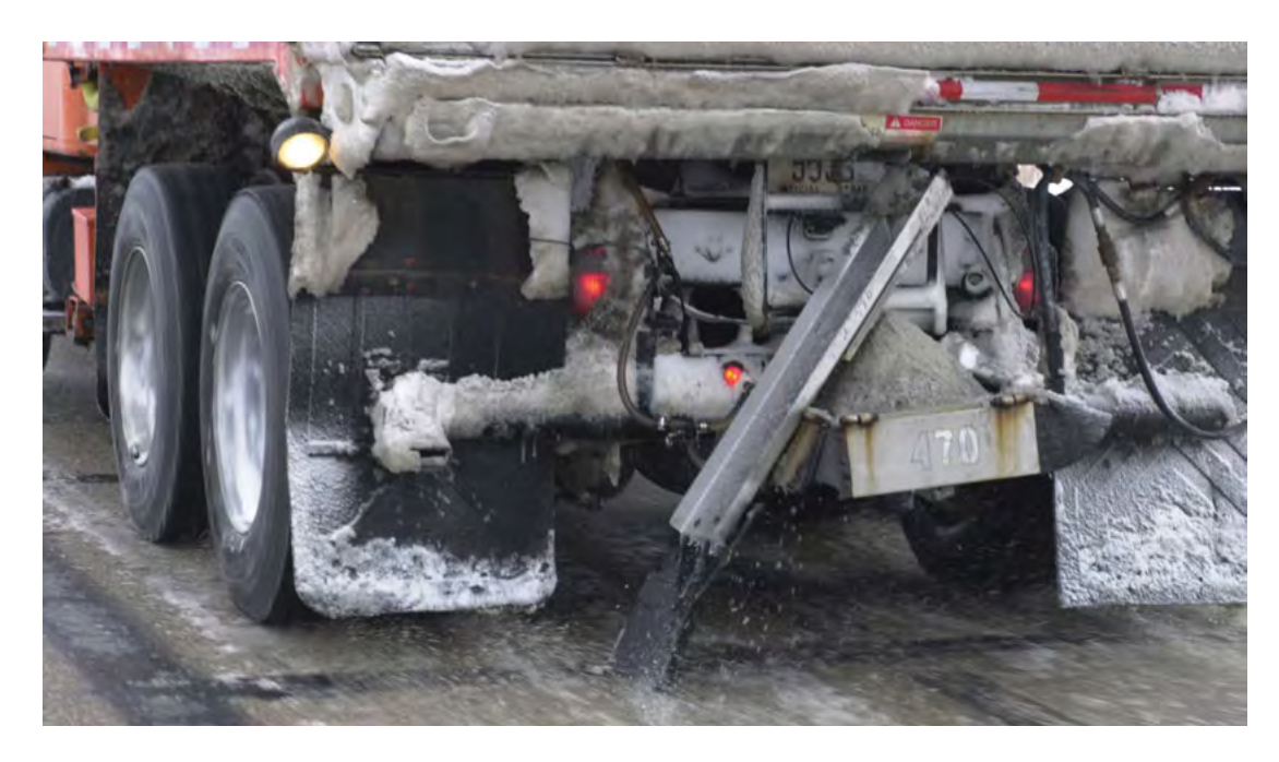
Clear Roads focuses on practical outcomes, such as optimizing the rate at which salt and other deicing materials are applied to roads by winter maintenance vehicles.