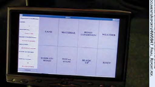
Touch screen device in a snowplow cab; compatibility between the complex technologies on winter maintenance vehicles can be a challenge.