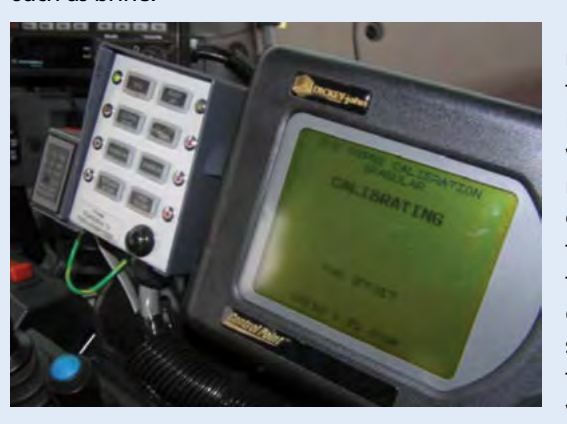
A ground-speed controller in calibration mode.

In a 2008 Clear Roads project, researchers compared manual controllers against two types of ground-speed controller: open-loop systems, which monitor truck speed during operation, and closed-loop systems, which monitor both truck speed and spreader discharge and adjust the spreader speed accordingly.<sup>a</sup> Most of the seven controllers in the test could distribute solid materials, such as salt and sand, as well as liquid materials, such as brine.