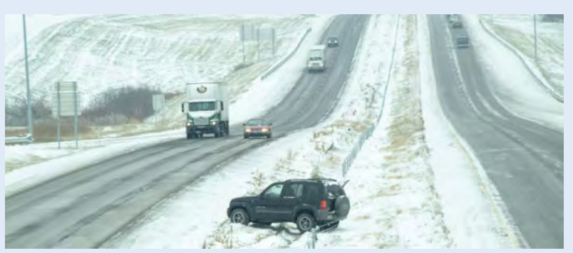
Analysis of crash data showed that failure to control speed was one of the leading causes of winter-related crashes.

{\it a} www. clear roads. or {\it g}/driver-safety-resources. html.