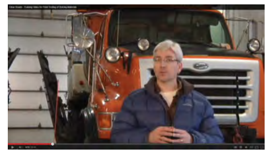
The Clear Roads goals have expanded into technology transfer, including a training video on the testing of deicing materials.<sup>5</sup>

The project also produced valuable hands-on calibration experience and led to the development of a spreader calibration guide,<sup>b</sup> including step-by-step procedures and checklists.