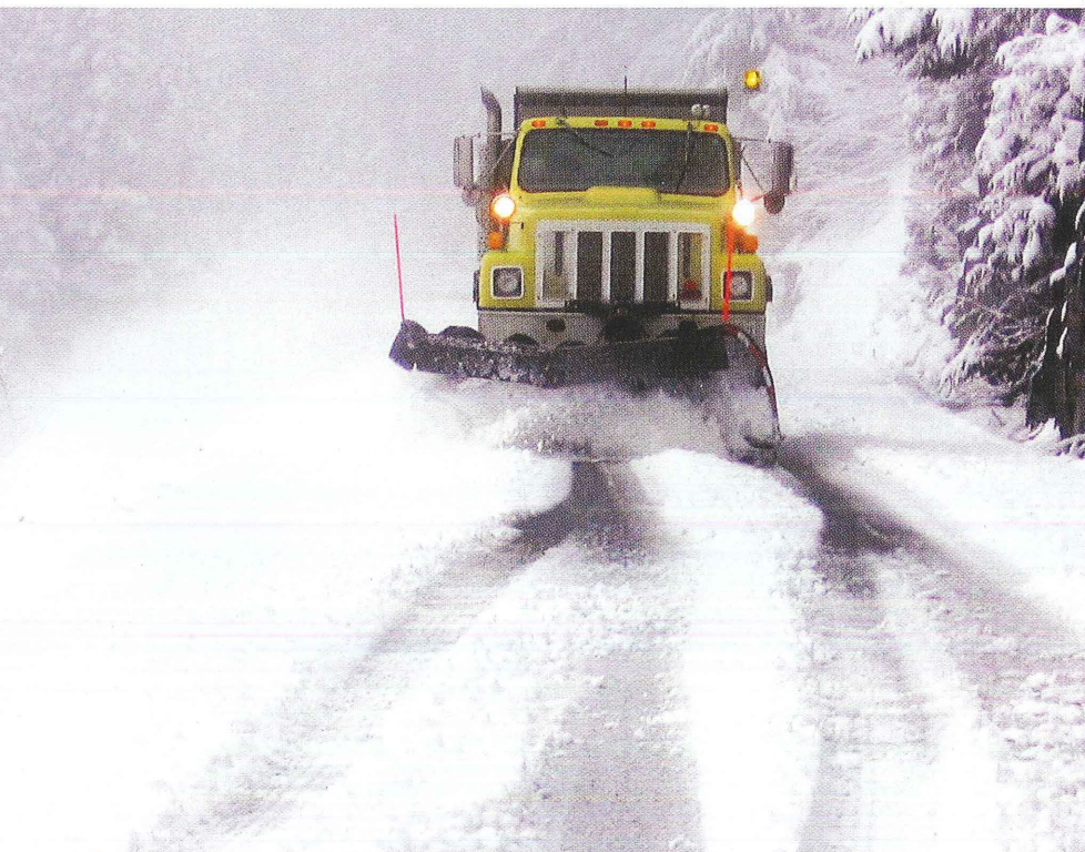
The winter-severity index developed by Clear Roads includes obvious factors, such as snowfall amount, but also indicators more difficult to quantify, such as the occurrence of blowing and drifting snow, which can dramatically increase the difficulty of snow removal.

This model data was then loosely fitted to aggregate observations from weather stations in order to ensure the weather data underlying the project was grounded in reality. The researchers used a suite of algorithms to derive hour-by-hour estimates of historical snowfall rates and the occurrence of blowing and