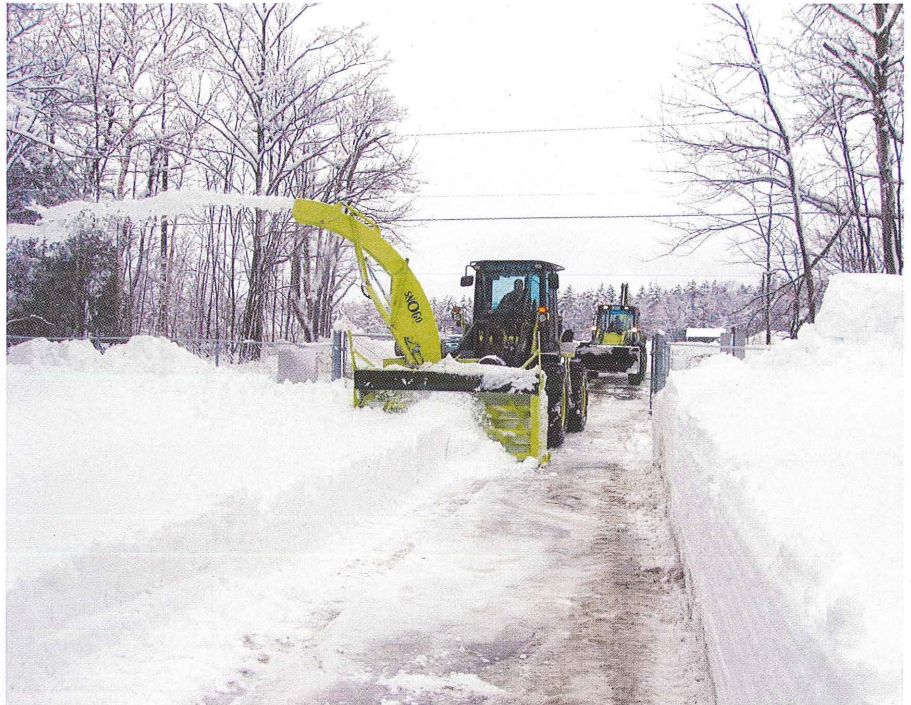
Standardizing data collection across agencies and accounting for level of service will further enhance agencies' ability to compare winter-maintenance costs with states that have similar climates and roadways, allowing them to consider new budget scenarios.