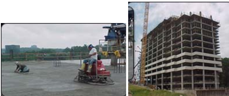
Figure 1. Finishing a concrete floor for commercial construction

Wintertime construction in northern climates for industrial and commercial facilities is often dependent upon temperature for placement and curing of concrete. It is common for temporary shielding for facilities such as a building to be established with plastic sheeting and heating provided for ambient temperatures to meet the minimum concrete placement temperature of 40 F. However additional heating during the initial set could accelerate curing and therefore increase the speed of construction. One example is the introduction of heat upon completion of “floating” and finishing a concrete slab on the float itself. Figure 1 below illustrates the finishing of a floor during commercial construction.