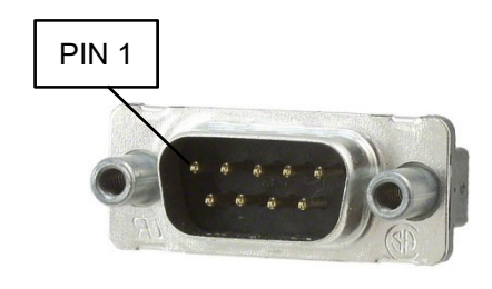
Figure 2: EXAMPLE Male 9-pin SUB-D Connector on compatible AVL Device

A.2 Compatible AVL devices shall provide RS-232 connectivity through a male 9-pin SUB-D connector similar to Figure 2 with (2) 4-40 jack screws and the following pinout: