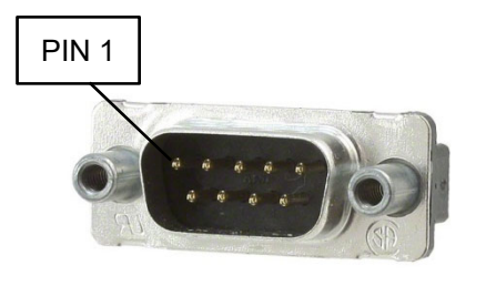
Figure 2: EXAMPLE Male 9-pin SUB-D Connector on compatible AVL Device

A.2 Compatible AVL devices shall provide RS-232 connectivity through a male 9-pin SUB-D connector similar to Figure 2 with (2) 4-40 jack screws and the following pinout: