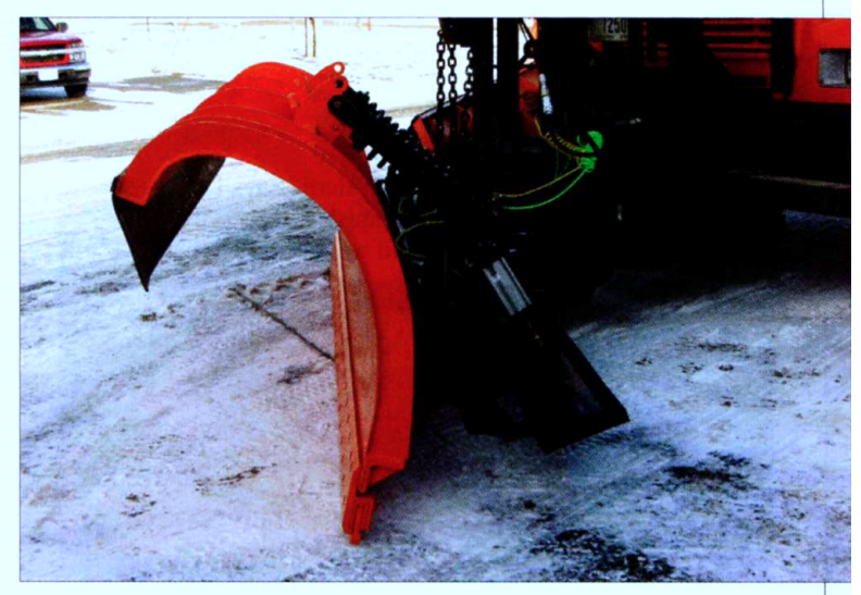
■ This prototype multiple-blade plow built by Flink for the Iowa Department of Transportation has a flexible edge, referring to the flexible carbide-cutting edge. It is currently being tested in Iowa.

The project, headed up by the Wisconsin Department of Transportation, compared the automatic ground-speed-control systems to manual systems to determine the accuracy of the precision and accuracy of the different systems with delivery the desired quantities of salt and other chemicals — essentially tracking the materials dispensed onto the roads. The study, Calibration Accuracy of Manual and Ground-Speed-Controlled Salters (project CR2005-02). Researchers also found greater savings for variable-speed roadway tests that included stop-and-go conditions than for freeway tests at a more constant speed, which may be of particular interest to municipalities. "It's important to use only what deicing material is needed, a a properly