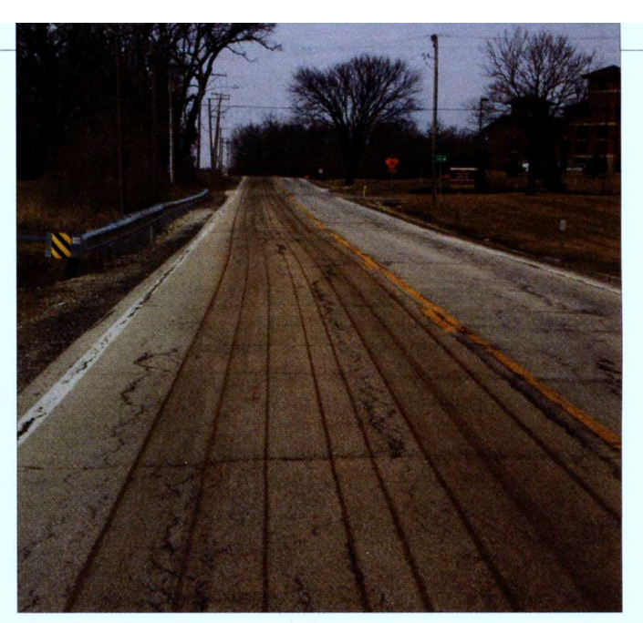
Organics such as sugar beet, sugar cane or corn syrup can be mixed with saltwater and calcium chloride to make an anti-icing blend that's applied prior to a snow or ice event to keep salt on the road longer. This residual effect helps to reduce the amount of salt needed and how often it must be reapplied.