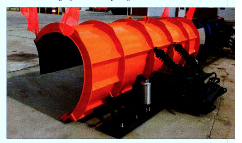
The Iowa DOT designed and built this multiple-blade plow at the shop level. Four different companies subsequently made multiple-blade plows based on the Iowa DOT prototype after the agency enlisted their help. The blades are being tested in five states.