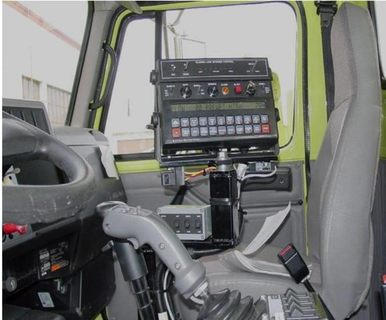
Figure 3-4: Open and closed loop controllers maintain a constant material application rates

The choice between the use of an open and closed loop controller is one of agency preference. In essence, an open loop controller is basically a manually operated controller, while a closed loop controller is more precise and provides more control on application. Additionally, closed loop controllers have an auger sensor which allows them to monitor the actual rate of the auger, and adjusts the control valve until the correct auger speed is achieved. Closed loop systems are more accurate in the delivery of the material and are easier to calibrate. This translates into savings which far outweigh the cost of a controller. However, it is a little less costly to purchase a system without an auger sensor, possibly the reason for some agencies to select an open loop controller. Note that some newer controllers now have GPS integrated into them, providing the ability to track information. Where open loop controllers are used, it is often done during a storm to spread more materials than typical settings would allow. Outside of such use during one or two runs, closed loop control is generally employed.