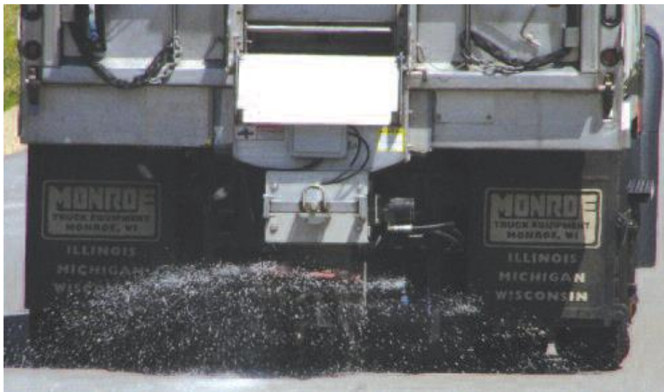
Figure 3-7: Salt slurry generator in operation

Salt slurries are a mix of finer grained salt mixed with liquids that form a brine to cover the roadway surface with more salt particles (35). The liquid aids in helping the salt stick to the roadway and melt ice faster. The generation of the slurry is done by a salt slurry generator equipped on the back of a plow vehicle, as depicted in Figure 3-7. The system operates by transferring dry salt from the hopper (by gravity) onto a conveyor belt or augur. This salt is fed through a roller that grinds it into finer particles. These particles then fall through a spray of water which mixes with them to produce the slurry brine. The resulting slurry is then spread onto the roadway via a spinner. The liquid to solid ratio employed in this process is typically 30:70.