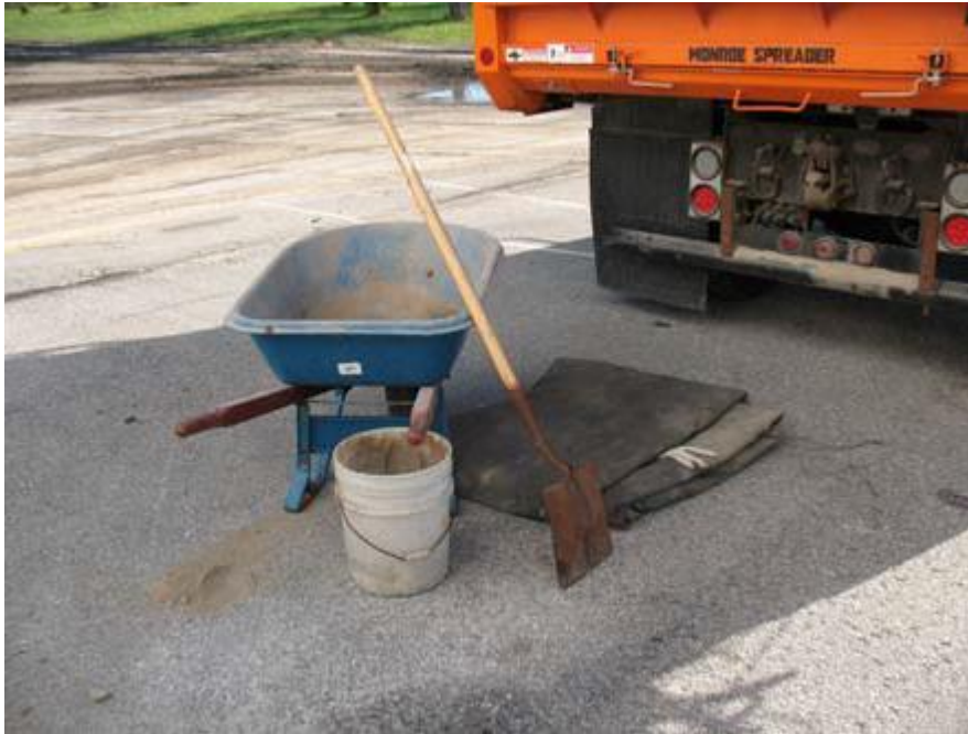
Figure 3-8: Tarp and wheelbarrow being used in calibration