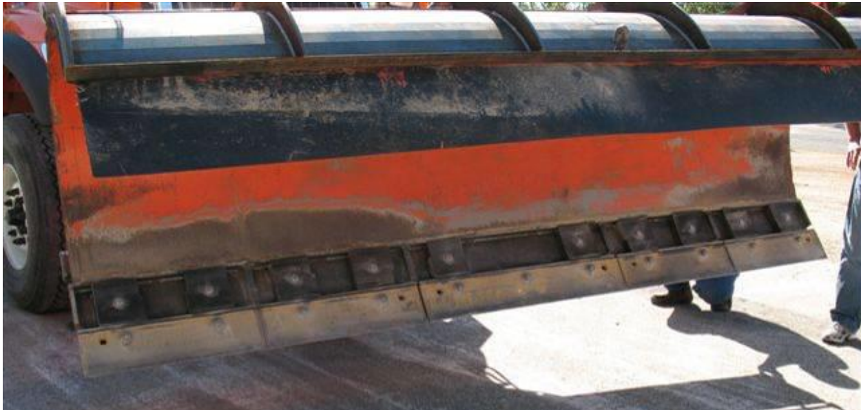
Figure 3-1: Flexible blade system