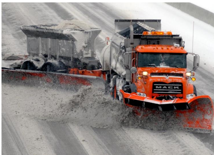
Figure 3-9: Tow plow in use in Utah

A tow plow is a trailer equipped with a snow plow towed behind a tandem axle truck equipped with a front snow plow. An image of a tow plow is presented in Figure 3-9. In operation, the trailer swings to the right of the towing vehicle to plow a second lane, covering a distance of 25 feet at speeds up to 55 mph (43). The trailer and plow are controlled hydraulically by the driver of the plow truck. In doing so, the work traditionally performed by two plow trucks is accomplished by one, resulting in improved efficiency and economics. While still a relatively new piece of winter maintenance equipment, a number of evaluations and performance information has been generated to date.