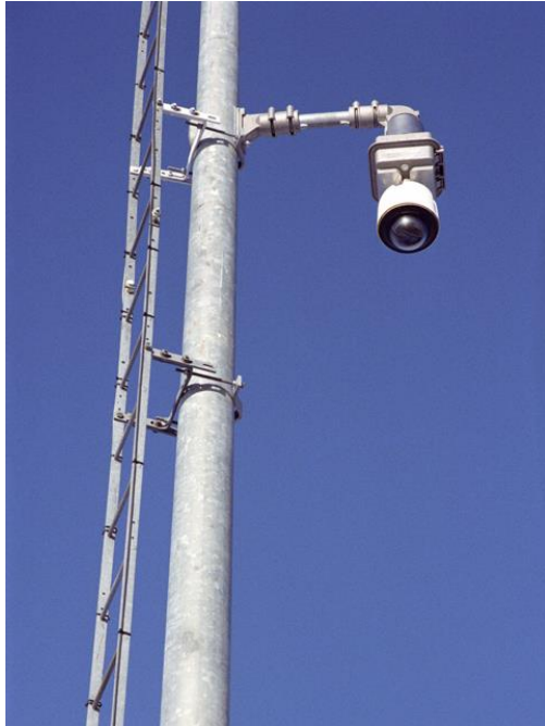
Figure 3-6: CCTV sites provide observation capabilities in remote locations