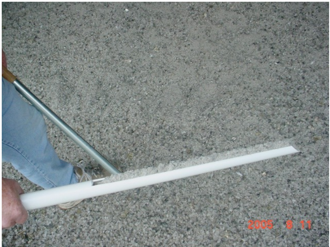
Figure 6. Taking a salt sample from the stockpile for testing at a laboratory