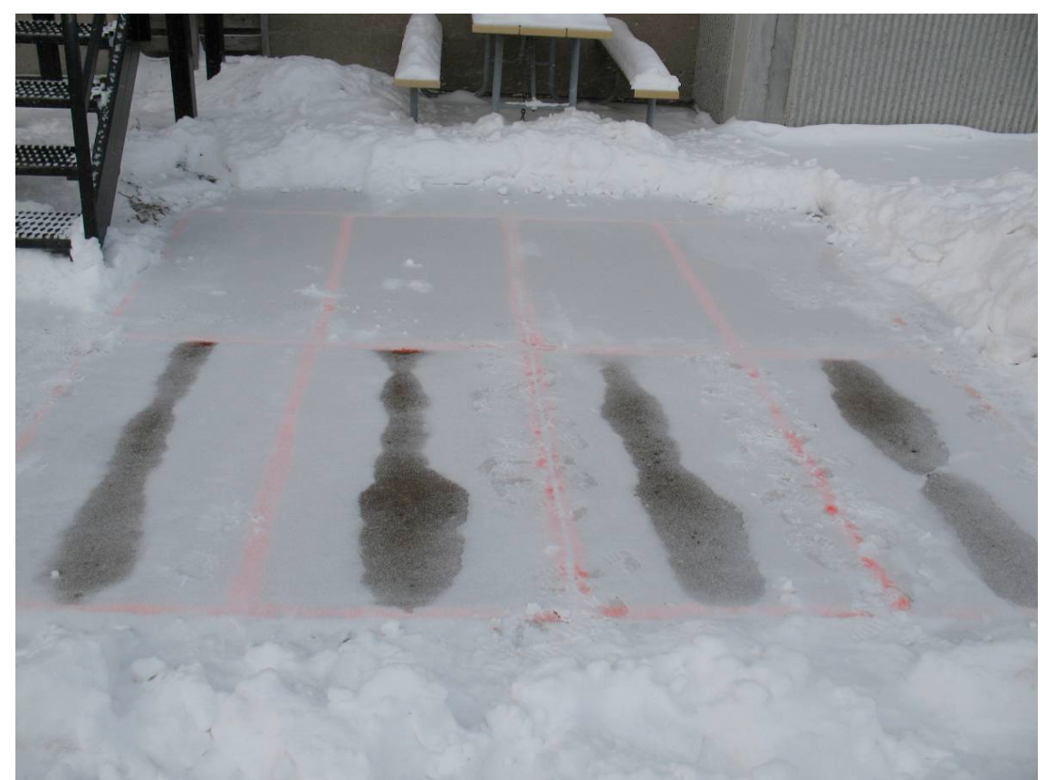
Figure 3. Images collected after a snowfall to show differences between different deicers

RWIS sites with atmospheric and pavement sensors will provide the best data for a comprehensive review of deicing chemicals performance. If an RWIS site is not nearby a handheld radiometer should be used to collect air and pavement temperatures throughout the test period. Make sure the radiometer is calibrated before each use.