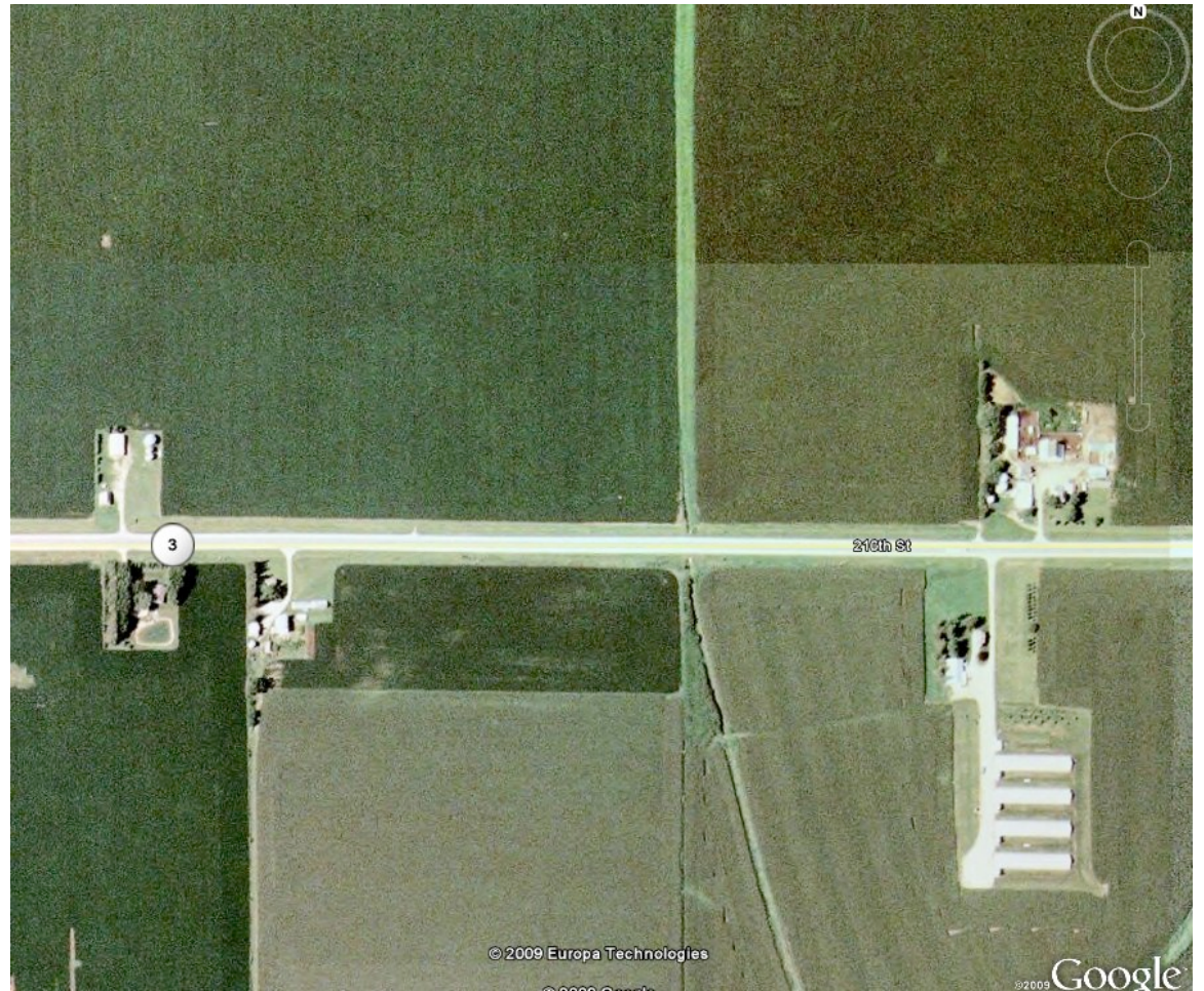
Figure 9. Aerial photo of test location

To describe the location of the test area in the final report an aerial photo, map or drawing of the test site will be helpful.