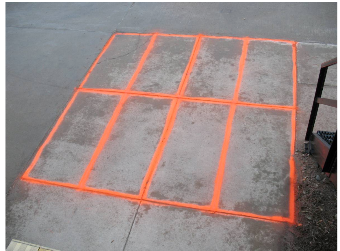
Figure 1. Grid painted on the concrete near a garage for testing multiple deicers

The roadway or test location selected for the testing should be in good physical condition and representative of other roadways in the area. A sidewalk can also be used for this test but the user should be aware of the thermal property differences between a sidewalk and a roadway. Make sure to mark the test area with paint or other markings so it's easy to find when making observations or reapplying deicing chemicals. The test locations should be at least a 3-foot by 3-foot square to make it easy to observe changes.