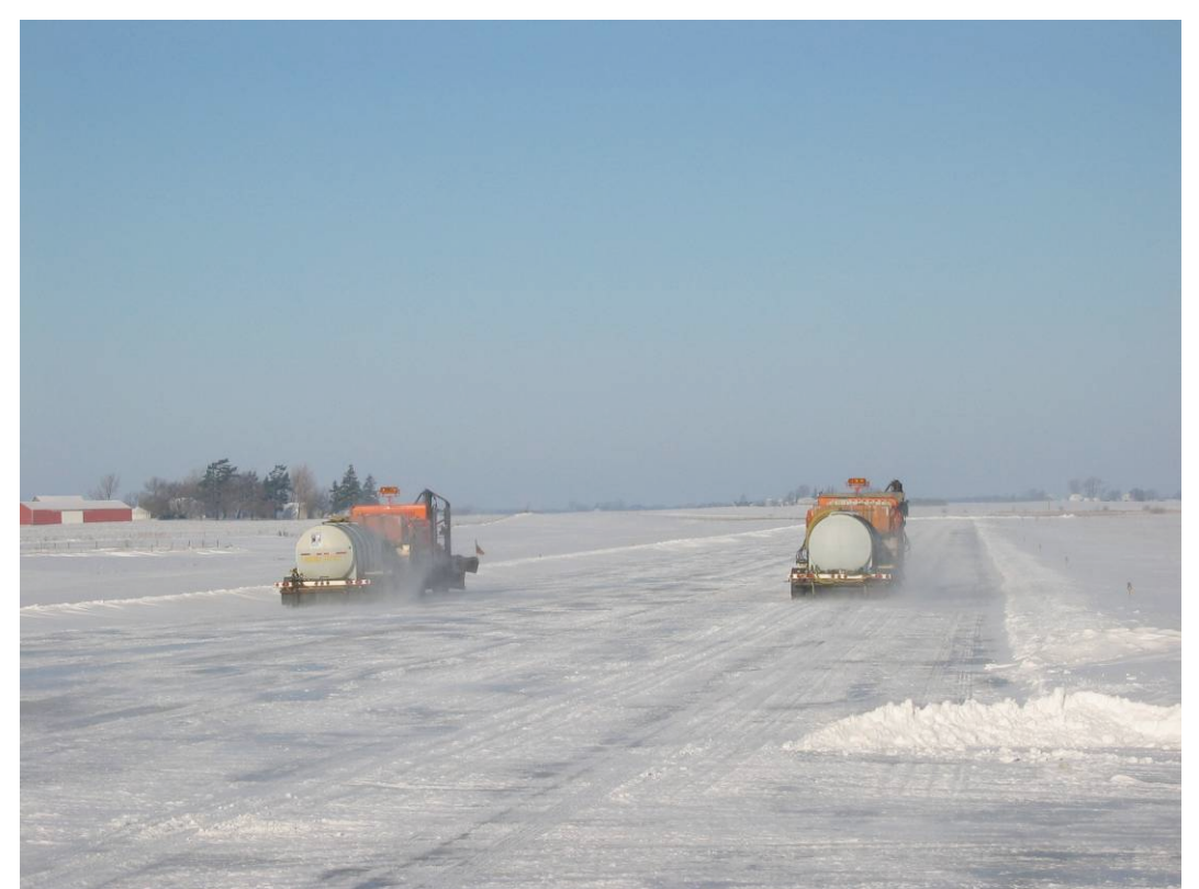
Figure 7. Side by side testing in parking lot