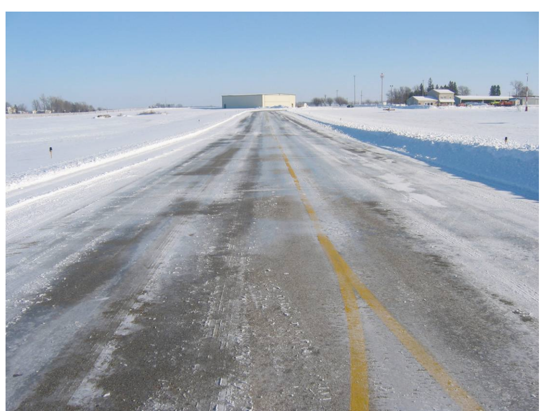
Figure 8. Side by side comparison of two different liquid deicers Weather: