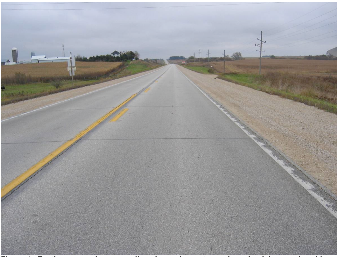
Figure 4. Testing on one lane may allow the evaluator to see how the deicer works with traffic. Note the roadway is fairly representative of roadways in the area and doesn't have roadway or weather variables that might influence the results of the testing.