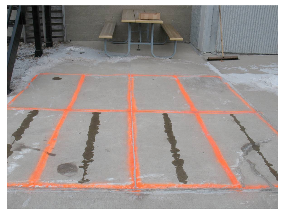
Figure 2. Different liquid deicers were applied to the grid in smaller amounts to replicate how a 50 gallon per lane mile application would look on the roadway

The best approach is to use a fertilizer spreader or other device that can spread material uniformly in the test area. Make sure to adjust the amount of material being spread for the size of the test area. If you typically apply 250# of material per lane mile on the roadway the application rate on a 3 x 3 test area has to be reduced significantly to replicate what would be used on a roadway.