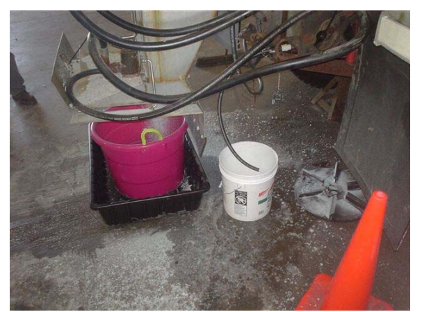
Figure 4-10 Large plastic tub inside a mason tub for catching small amounts of discharged solid material.