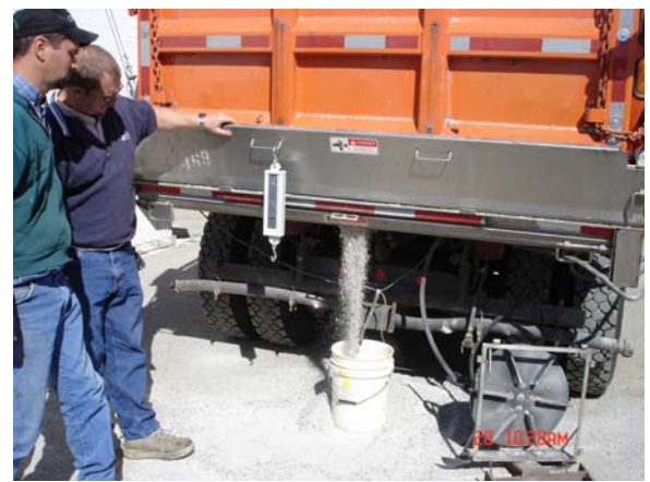
Figure 4-11 Plastic 5-gallon bucket used for catching small amounts of discharged solid material.