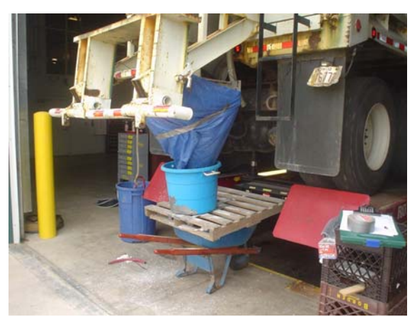
Figure 6-9 Example of conducting drop test with an open-loop controller in Ohio.

10. Abort the calibration test(s) if a discontinuity in flow of either solid or liquid material discharge is observed.