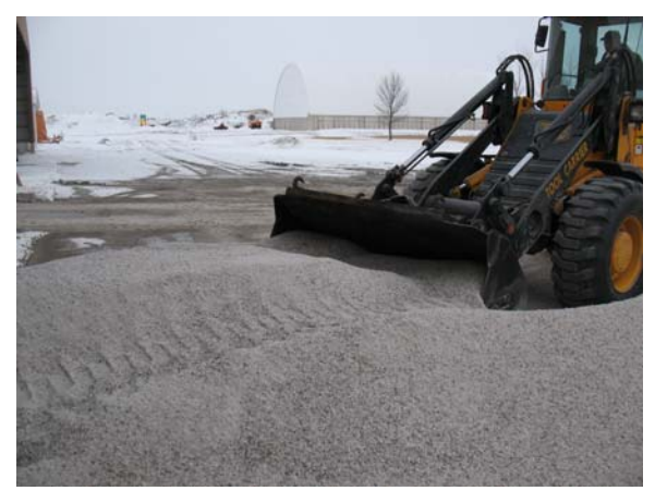
Figure 4-4 Uniformly prepared solid material under cover.