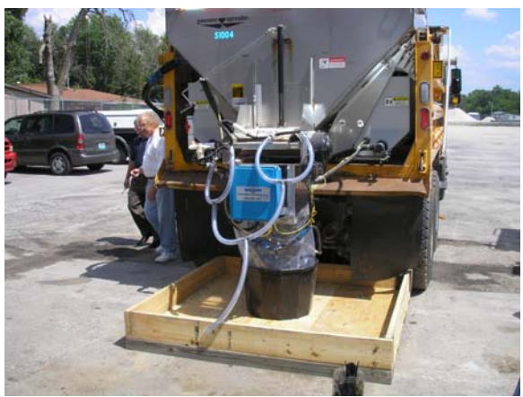
Figure 4-8 Single containment box used to collect up to 200 lbs of discharged dry solid material.