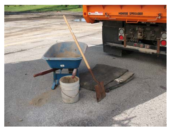
Figure 4-15 Tarp with shovel, broom, and wheelbarrow for collecting solid discharged material.