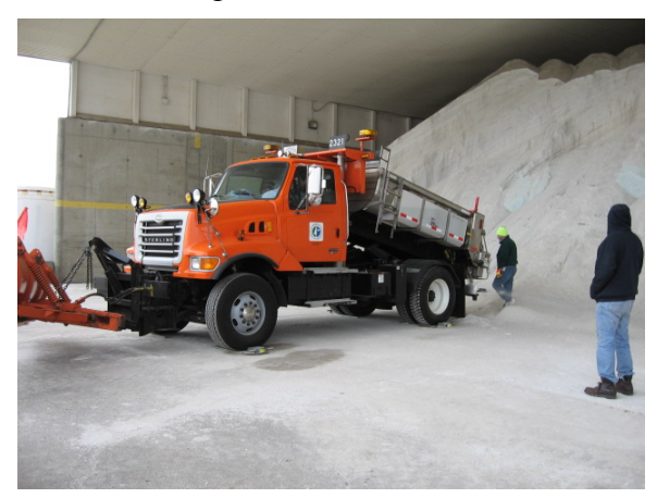
Figure 6-3 Truck-bed raised to an operational elevation for calibration.

5. For tailgate spreaders, verify that the truck-bed can be raised to an operational elevation and make sure that the auger can be fully charged during the complete calibration process. (See Figures 6-3 and 6-4)