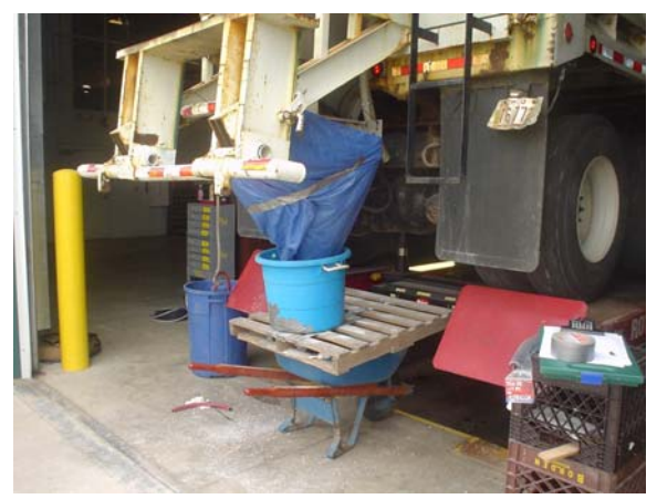
Figure 4-2 Spreader truck on a hydraulic lift for drop tests.

jacks are used. (Figure 4-2 shows a truck on a hydraulic lift and Figure 4-3 shows hydraulic jacks used to raise the drive wheels off the ground.)