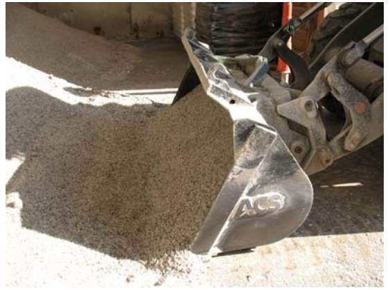
Figure 5-1 Uniform bulk material