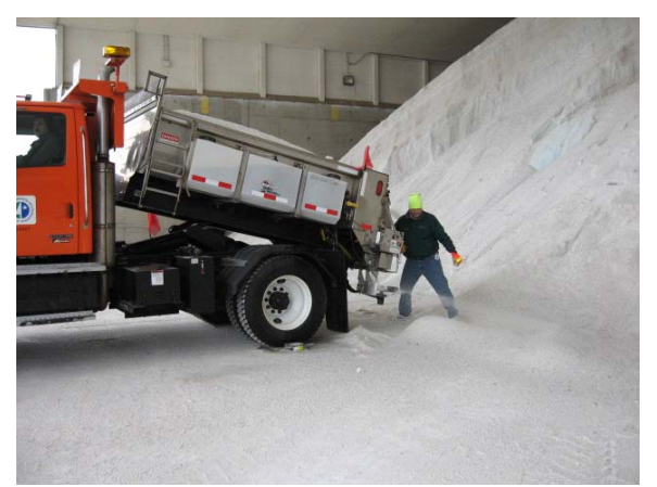
dry solid material dumped directly on to the solid storage pile.