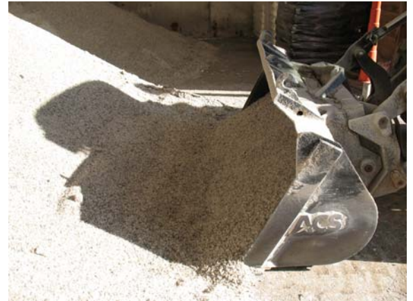
Figure 6-1 Uniform bulk material.