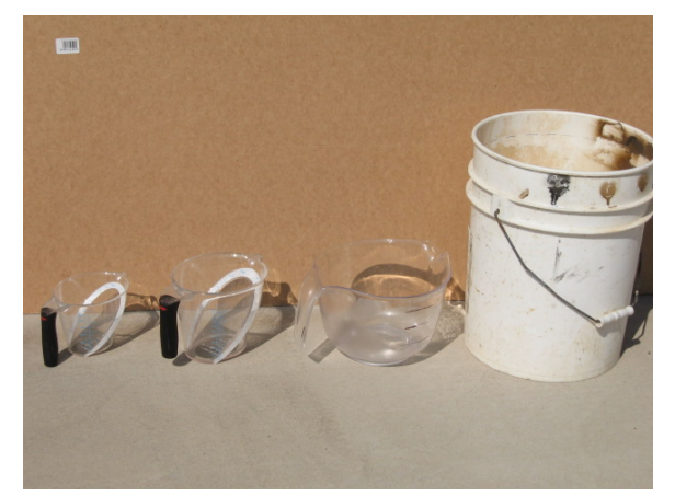
Figure 4-18 Containers for measuring the volume of liquid discharged during calibration.