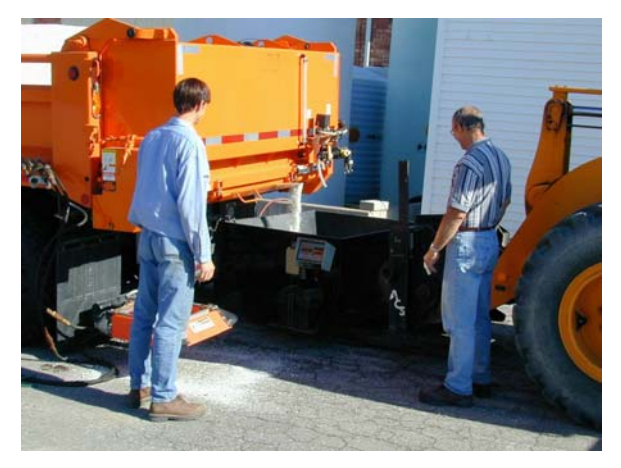
Figure 4-7 IDOT's large hopper and load cell used in calibration work.