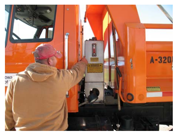
Figure 6-7 Check the operational temperature of the truck's hydraulic oil.