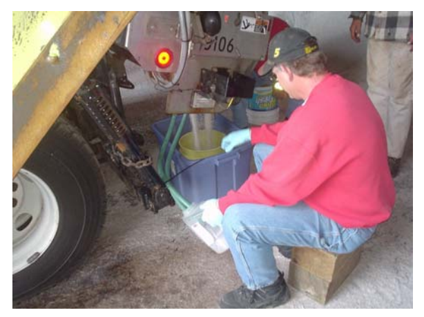
Figure 6-8 Example of solid and liquid materials being collected during drop tests in Wisconsin.