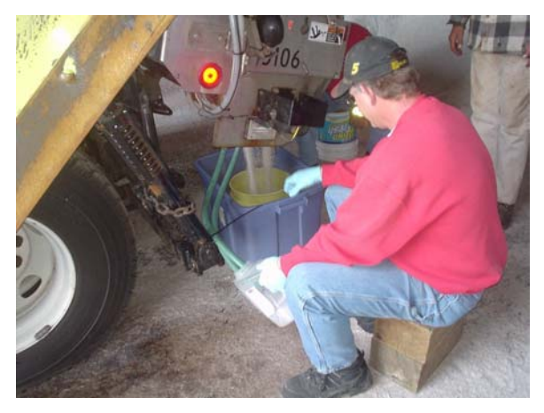
Figure 5-9 Example of solid and liquid materials being collected during drop tests in Wisconsin.