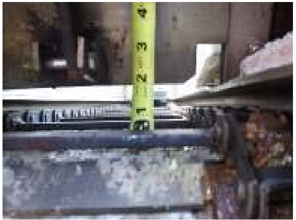
Figure 6-2 Selection of an appropriate single gate opening for range of application rates to be used.