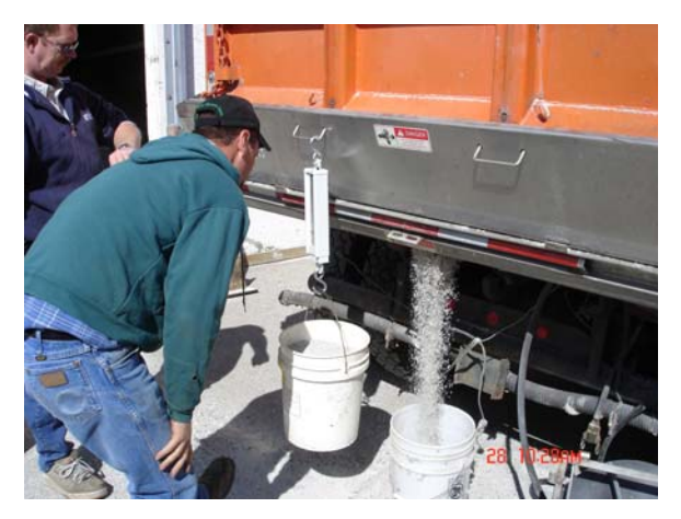
Figure 4-12 Dairy scale used to weigh a 5-gollon plastic bucket with solid discharged material.