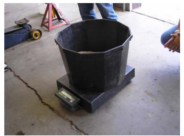
Figure 4-9 Portable scale used to weigh about 100 lbs of discharged dry solid material.