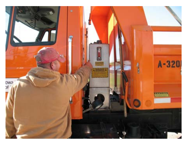
Figure 5-7 Check the operational temperature of the truck's hydraulic oil.