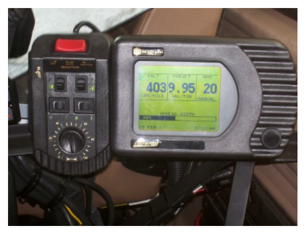
Figure 5-6 Speed readout of 20 mph on the controller in the truck cab.