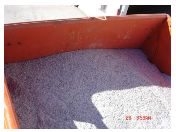
Figure 6-4 Photo showing tailgate auger fully charged during the calibration process.

6. When calibrating the prewetting system, leave the spray nozzles in the discharge lines to account for back-pressure conditions. (See Figure 6-5.)