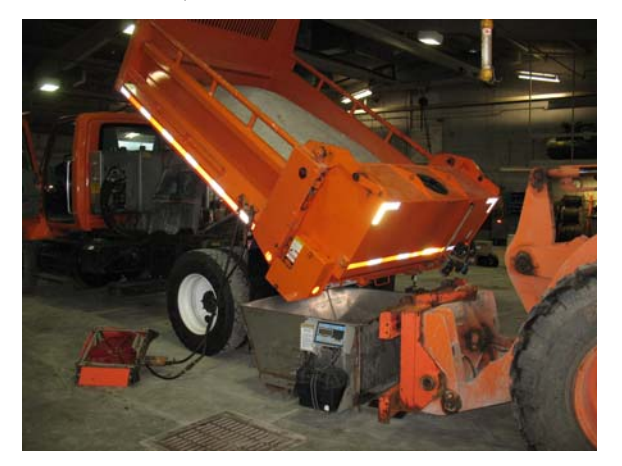
Figure 4-6 IDOT design and built large hopper and load cell used in calibration work.

• A calibrated platform or commercial scale will need to be used for discharged solid material weights of a thousand pounds or larger. (Figures 4-6 and 4-7 show a specially designed large portable hopper with a load cell built and used by IDIT to catch and weigh up to 2,000 pounds of discharge dry solid material during their spreader calibration work.)