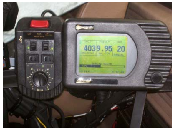
be Figure 4-1 Controller in a spreader truck

jacks are used. (Figure 4-2 shows a truck on a hydraulic lift and Figure 4-3 shows hydraulic jacks used to raise the drive wheels off the ground.)