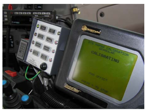
showing unit is in calibration mode.