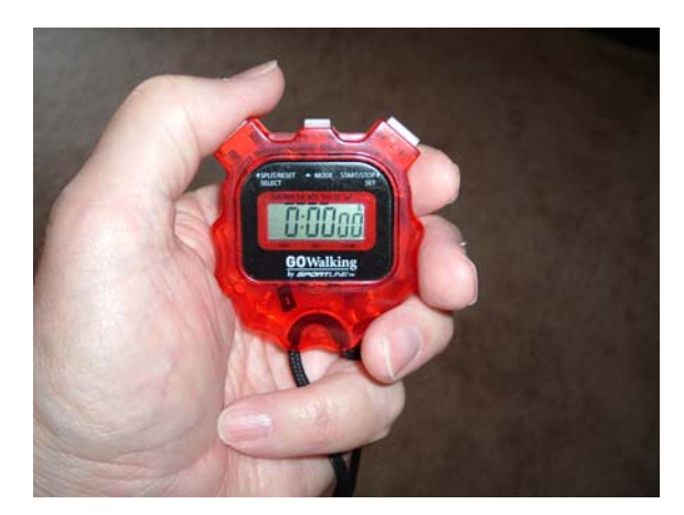
Figure 4-16 Suitable hand-held stop watch.