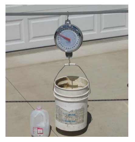
Figure 4-13 A 5-gallon bucket containing three gallons of water suspended from a dairy scale.