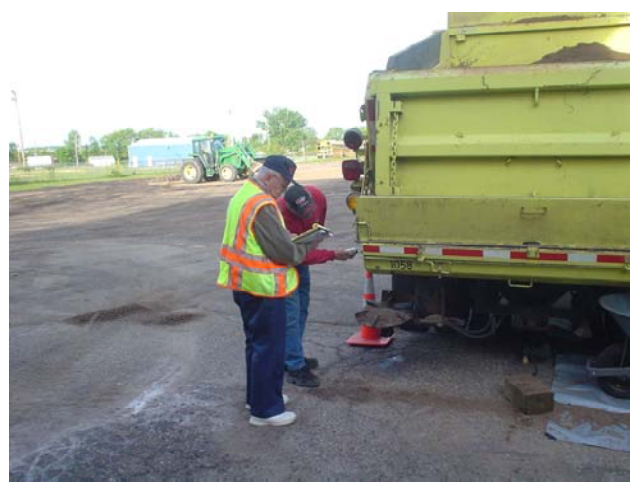
Figure 6-10 Measurement of revolutions of an auger/conveyor shaft for various control settings using a hand-held tachometer.