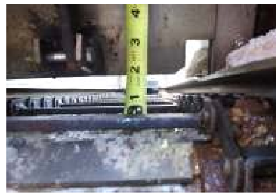
Figure 5-2 Selection of an appropriate single gate opening for range of application rates to be used.