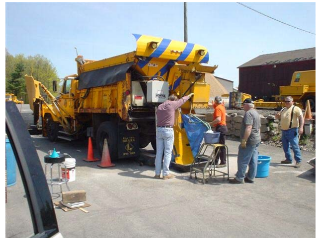
Figure 3-1 Example of having the truck jacked up to conduct drop tests in New York.

A number of calibration procedures are available to the users of dry and prewetted solid material spreaders. These procedures are generally available from the spreader and