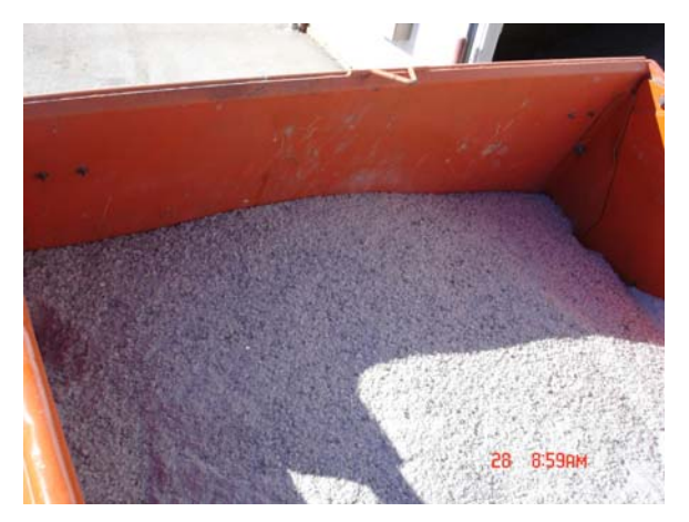
Figure 5-4 Photo showing tailgate auger fully charged during the calibration process.

6. When calibrating the prewetting system, leave the spray nozzles in the discharge lines to account for back-pressure conditions. (See Figure 5-5.)