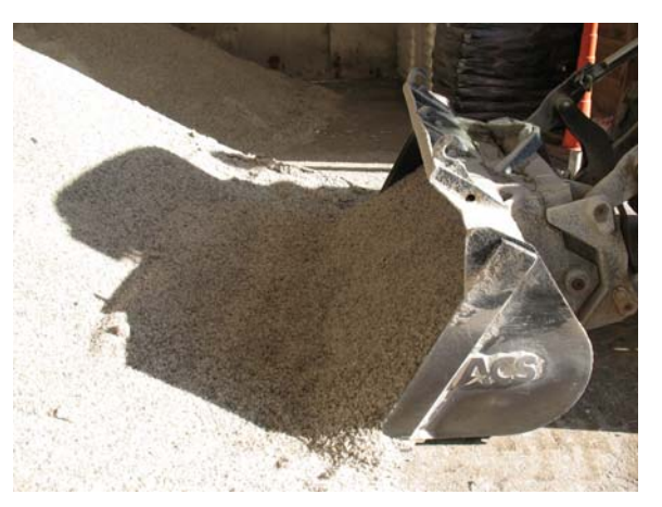
Figure 4-5 Mechanized loader bucker used to load spreader truck.

• A calibrated platform or commercial scale will need to be used for discharged solid material weights of a thousand pounds or larger. (Figures 4-6 and 4-7 show a specially designed large portable hopper with a load cell built and used by IDIT to catch and weigh up to 2,000 pounds of discharge dry solid material during their spreader calibration work.)