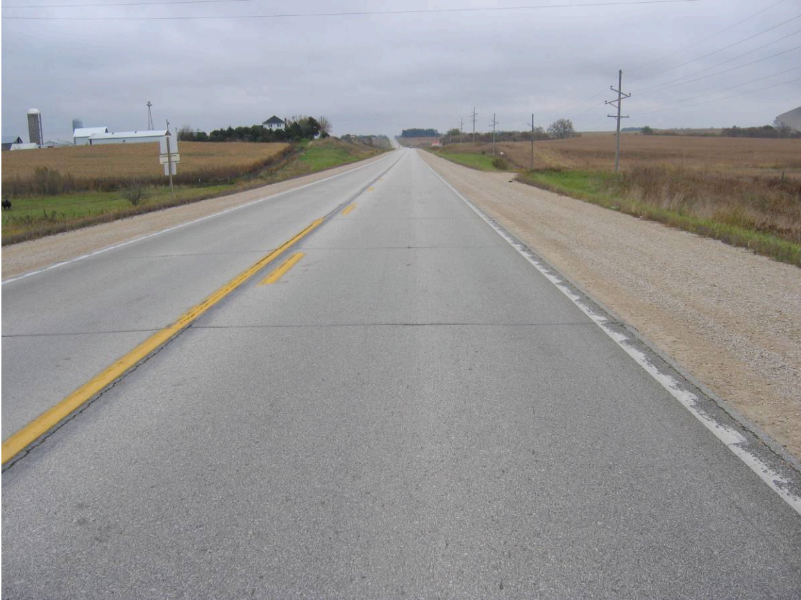
Figure 4. Testing on one lane may allow the evaluator to see how the deicer works with traffic. Note the roadway is fairly representative of roadways in the area and doesn't have roadway or weather variables that might influence the results of the testing.