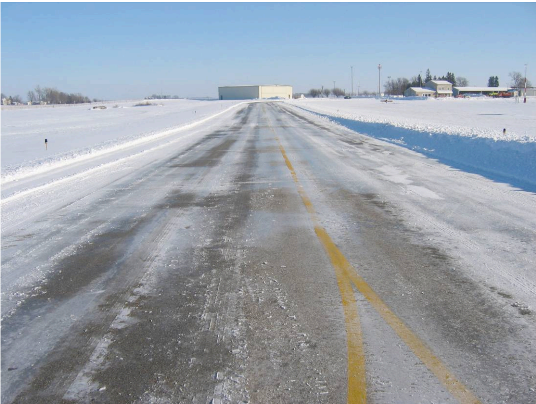
Figure 8. Side by side comparison of two different liquid deicers Weather: