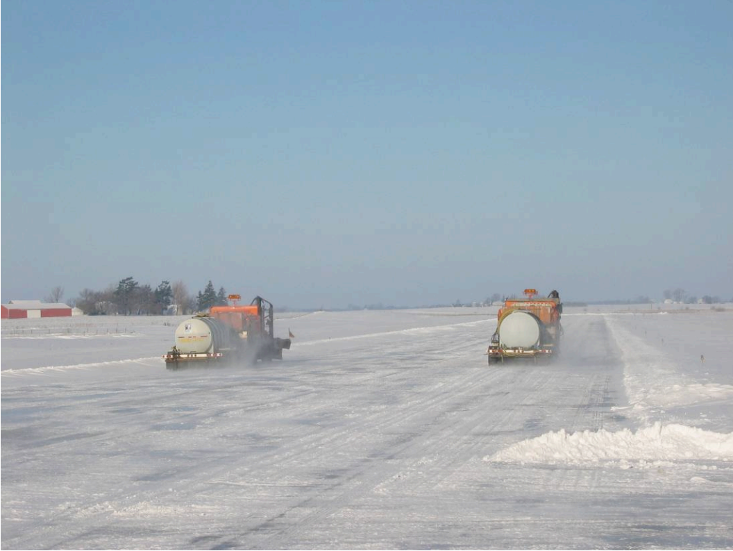
Figure 7. Side by side testing in parking lot