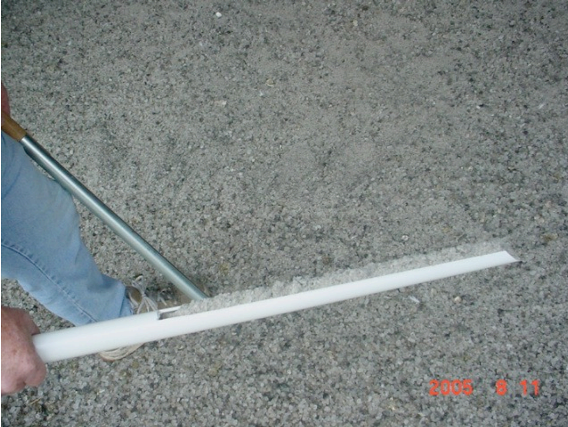
Figure 6. Taking a salt sample from the stockpile for testing at a laboratory