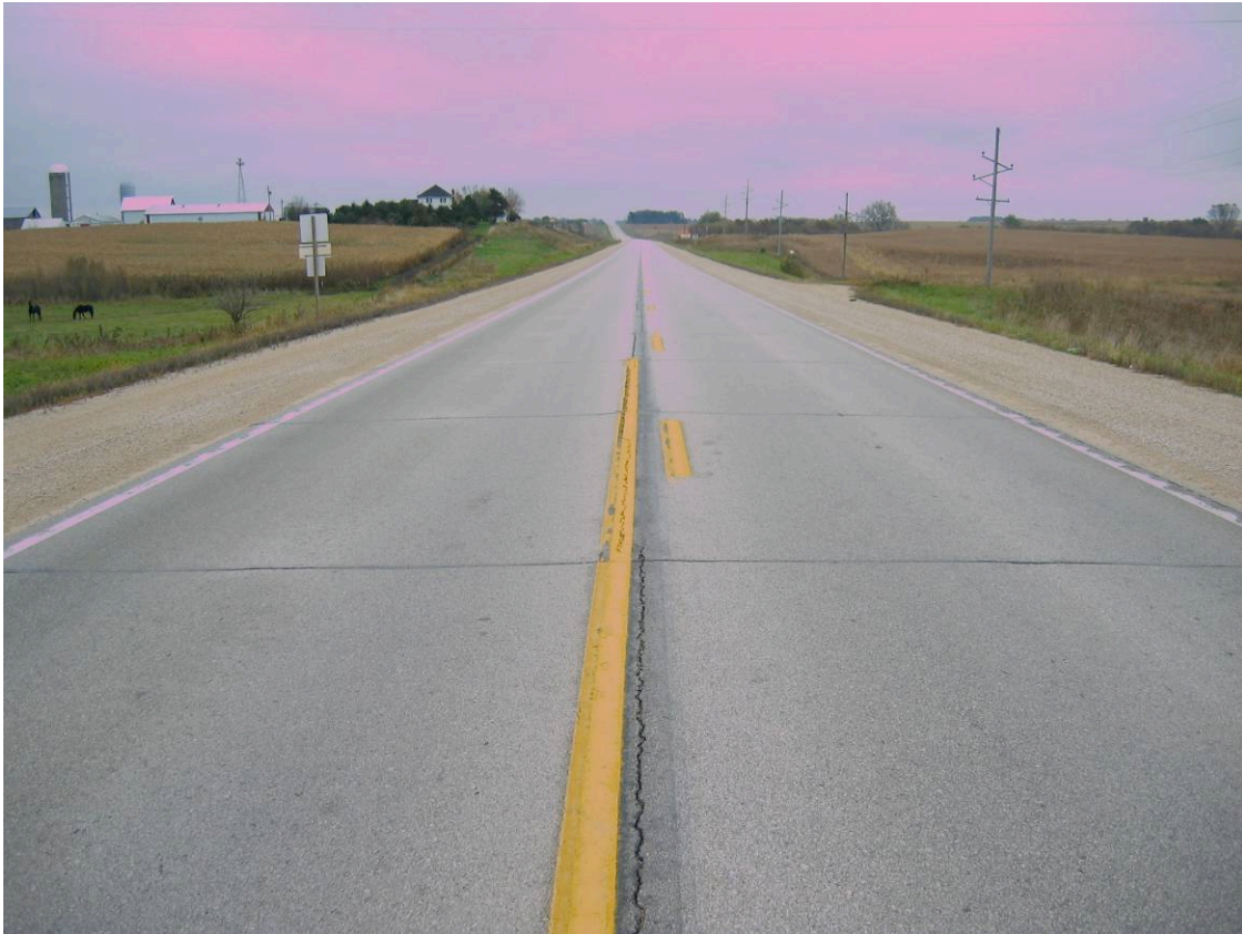
Figure 5. A two lane road might be used to test two different deicers, one in each direction or testing in only one lane.