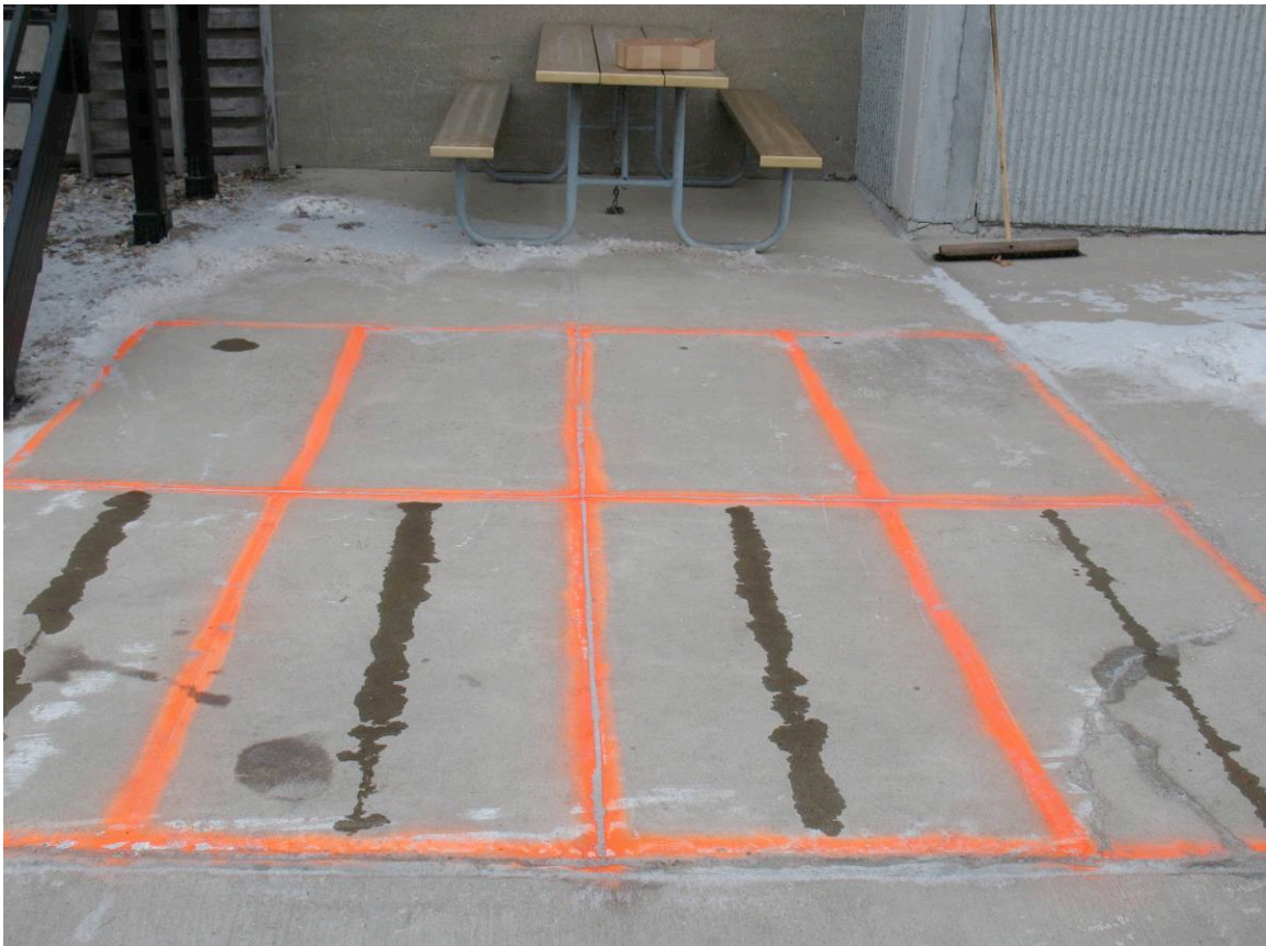
Figure 2. Different liquid deicers were applied to the grid in smaller amounts to replicate how a 50 gallon per lane mile application would look on the roadway

The best approach is to use a fertilizer spreader or other device that can spread material uniformly in the test area. Make sure to adjust the amount of material being spread for the size of the test area. If you typically apply 250# of material per lane mile on the roadway the application rate on a 3 x 3 test area has to be reduced significantly to replicate what would be used on a roadway.