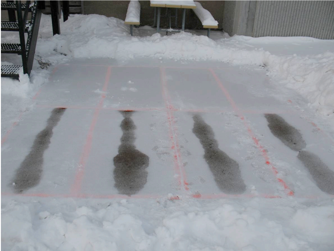
Figure 3. Images collected after a snowfall to show differences between different deicers

RWIS sites with atmospheric and pavement sensors will provide the best data for a comprehensive review of deicing chemicals performance. If an RWIS site is not nearby a handheld radiometer should be used to collect air and pavement temperatures throughout the test period. Make sure the radiometer is calibrated before each use.