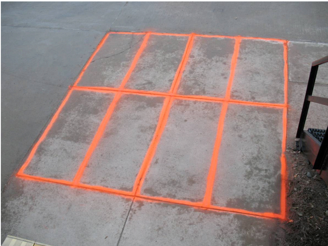
Figure 1. Grid painted on the concrete near a garage for testing multiple deicers

The roadway or test location selected for the testing should be in good physical condition and representative of other roadways in the area. A sidewalk can also be used for this test but the user should be aware of the thermal property differences between a sidewalk and a roadway. Make sure to mark the test area with paint or other markings so it's easy to find when making observations or reapplying deicing chemicals. The test locations should be at least a 3-foot by 3-foot square to make it easy to observe changes.